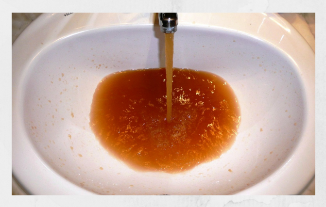
Poor quality of tap water in Pskov region