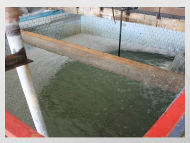
Fine filters of existing water treatment station in Pskov