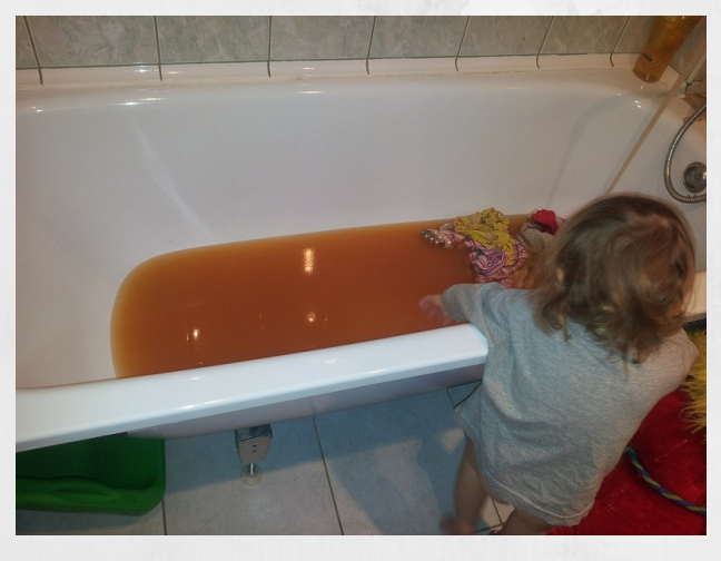
Poor quality of tap water in Pskov region